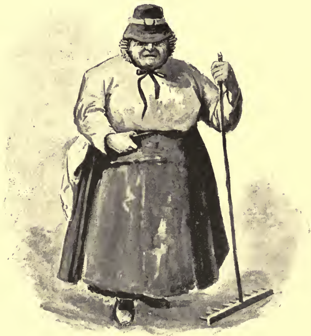
The cook at Rhyddu.

quently the flavour of the hay-fields was perceptible in that of the tea.